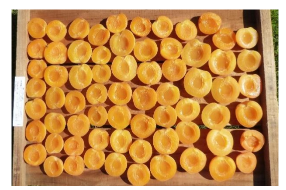
Freshly processed fruit of RiverCot 4 December 2016