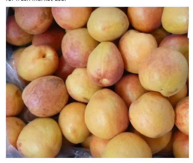
RiverCot 4 sensory panel fresh fruit 2017/18

This is an outstanding drying apricot but may be too challenging for fresh market use.