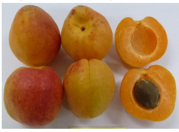
Fresh fruit of tree ripe RiverCot 4.