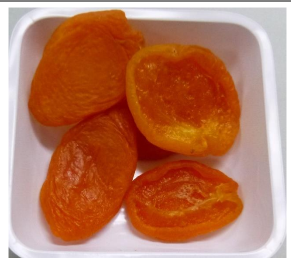
Dried halves of RiverCot 4 2016

The Tree: RiverCot 4 is a vigorous, spreading, spur bearing tree. It benefits from an increase in the number of leaders (6-8) to better fill space, spread vigour and control extension when grown in "free standing V" type systems. It appears well suited to pedestrian orchards planted at 4.5m by 2.5m spacing. Keep trees open to prevent green shoulders and condition fruit fruit. Summer pruning as a young tree will improve subsequent fruiting structures within the tree and reduce shading preventing a drop in fruit quality. If left untended the tree will produce long thick extension growth of little value. Capable of very large crops, these need to be managed or biennial bearing will occur with oversized less robust fruit in the off crop.