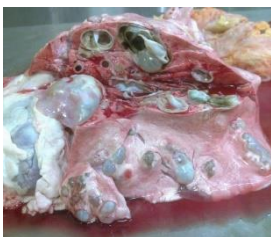
Hydatid cysts in sheep lung