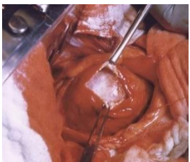
Hydatid cyst being surgically removed from human lung

Hydatids do not affect sheep health or production on farm. The economic consequences of hydatid infection in livestock are considered to be negligible.