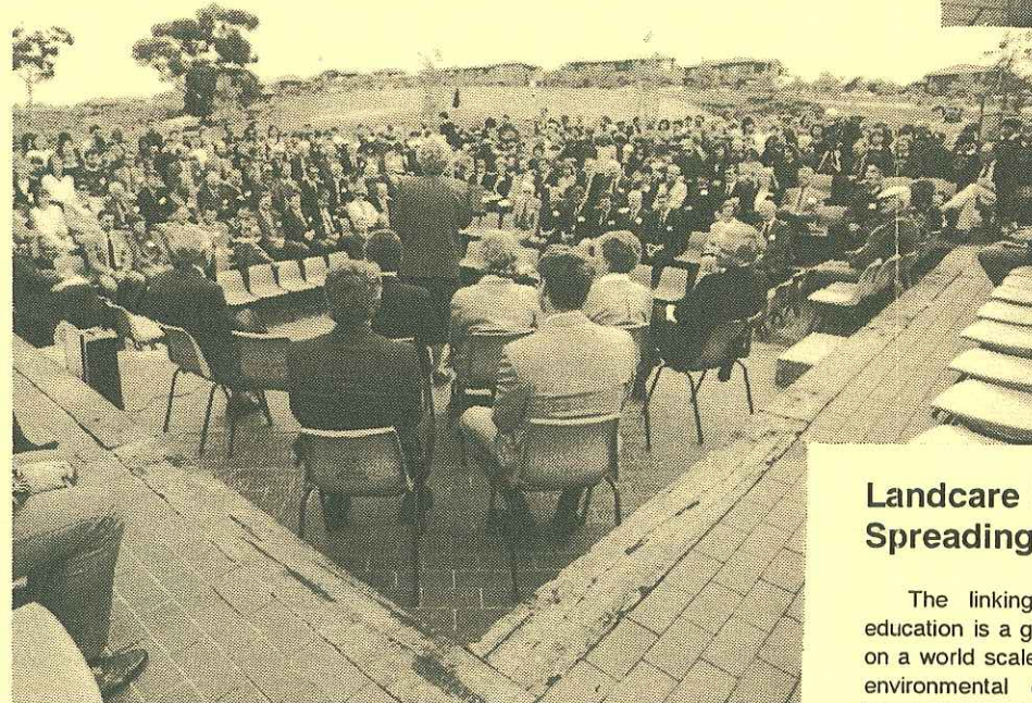
Above: The day of the opening and the many people who attended