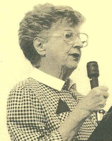
Above: Dame Roma Mitchell officially opening the Outdoor Classroom

designing education walks for school children of different ages. They have also requested a couple of changes to the Classroom to help the flow of children around the site. These changes have included extending a pathway and building a "cocky's bridge".