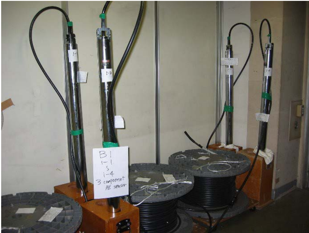
Figure 2. CRIEPI 3-component acoustic emission sensors deployed in WA network.

The MW wells were drilled by Condamine Drilling Pty Ltd in March and April 2003. Each well was drilled to 850m so as not to intersect the underlying Mackunda Formation. The top 60m covering the Lake Eyre Basin sediments were cased with 7 inch steel casing. The acoustic monitoring sensors were built by Auslog of Brisbane (Figure 3), and deployed as each well was drilled. Each sensor contains a triaxial array of six geophone elements (2 for each direction). The geophone elements are Geospace, model GS-20DX, with sensitivity of 0.346 volts/cm/sec. As two geophone elements are wired in series, the total sensitivity is 0.692 volts/cm/sec. Amplification using 12 volt power supply was initially trialed at the Habanero 1, but was later installed at the wellheads. Gain of up to 10,000 is available from the amplifiers.