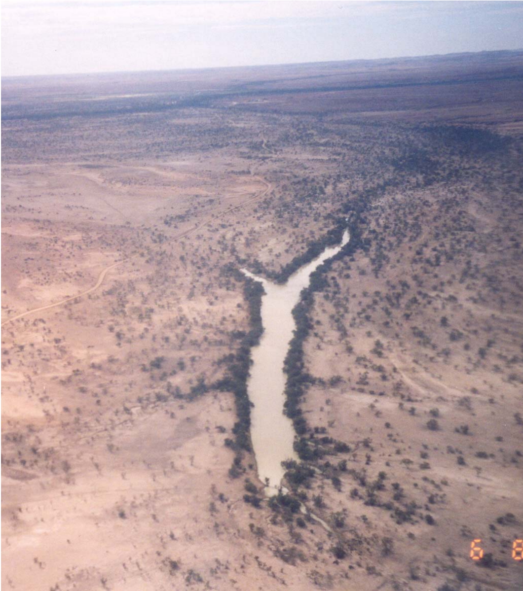
Figure 6. Water stored in Burley Waterhole. View looking north towards Cooper Creek. The Strezlecki Track is on the left side of the picture.

over the causeway at Innamincka. As an intermediate storage facility, the water was pumped 6 km to Burley Waterhole (Figure 6). From here it will be pumped 3 km to the Habanero 1 well site (see also figure 1). The pipeline route for the water supply was examined by an Aboriginal Heritage Clearance survey in March 2003, and a further survey in June 2003. The June 2003 survey resulted in a slight change of route from Burley Waterhole to Habanero 1 that avoided crossing a number of sand ridges.