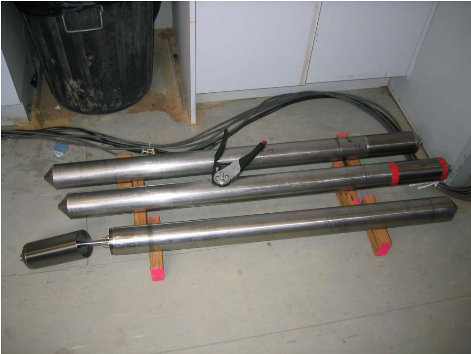
Figure 3. Sensors built by Auslog for MW wells.