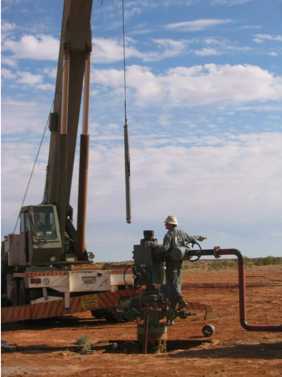
Figure 5. Deployment of NEDO acoustic monitoring sensor in McLeod 1 well on 24 August 2003. The housing for the locking arm is visible just above the centre of the tool.