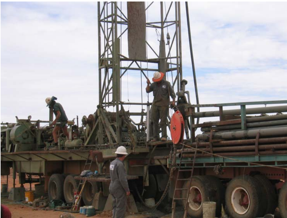
Figure 4 . Deployment of MW well sensor using Baker Atlas.