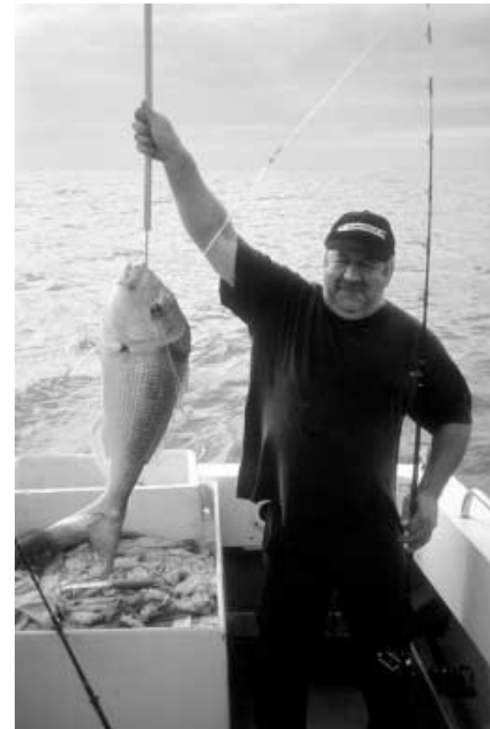
Fishing the high tide for Big Reds

"They are moving all the time and the trick is to hold them in one spot long enough to catch a feed. Along with the migrating fish are bigger and older resident fish that hang around rocky outcrops. Different techniques are