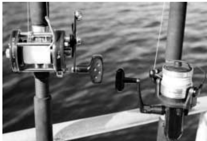
Make sure you keep your reels in good working order, or pay the penalty

"There is enormous enjoyment in snapper fishing, not only in the catch, but also in the eating. My bottom line for great snapper experiences is to rely on your records and pay attention to detail."