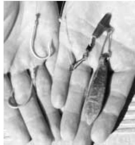
A standard rig of two hooks and a heavy sinker

"If you do want to keep a snapper, kill it straight away by inserting a sharp knife straight into the depression above the eye socket. The knife will enter the brain and kill the fish