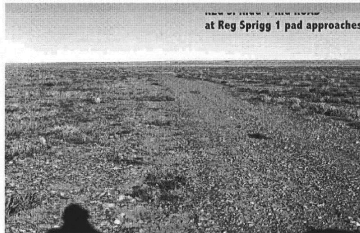
Figure 10. Gibber surface. Rolled rig road in Mitchell grass perennial grassland.