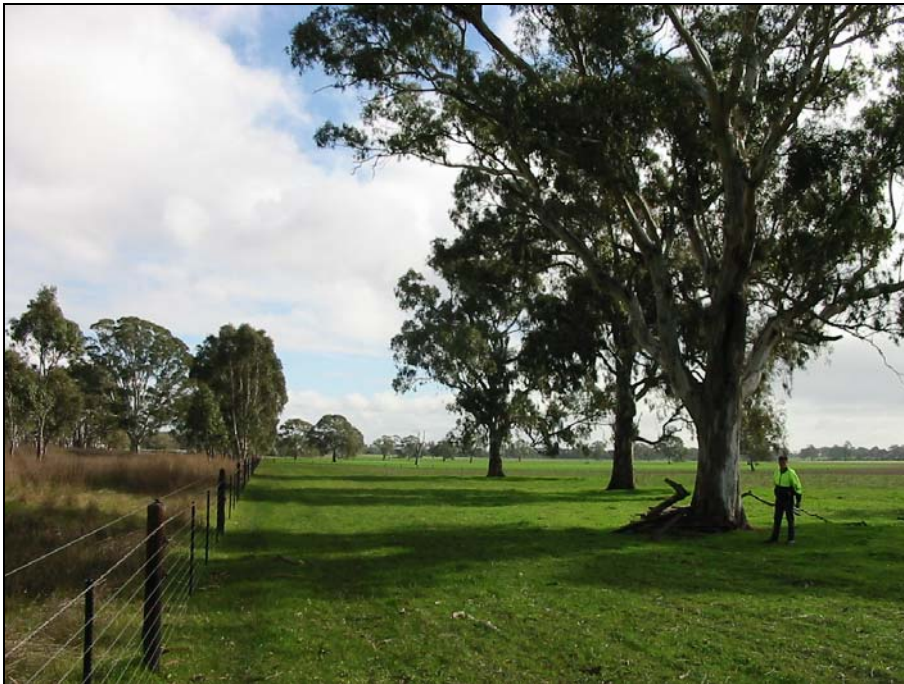
Plate 2: Pipeline Alignment Showing Large Red Gums on Easement

Three large River Red Gums are present within the 15 m easement and are located approximately 10 m from the fence line (Plate 2).