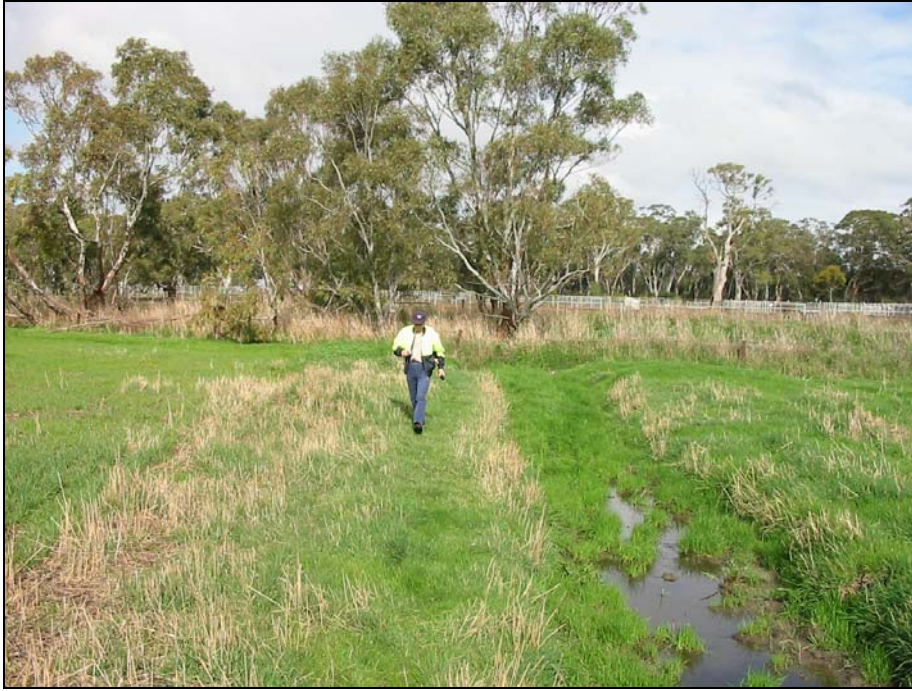
Plate 1: Small Drain Across Easement (Facing South Across Easement)