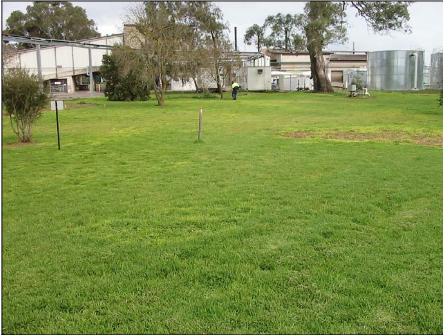
Plate 3: Proposed Meter Station Site

Within the abattoir grounds, the meter station site and its surrounds are vegetated with introduced grasses and planted trees, which are mostly exotic species (Plate 3). One small ash tree ( Fraxinus sp.) is present on the meter station site and will need to be removed.