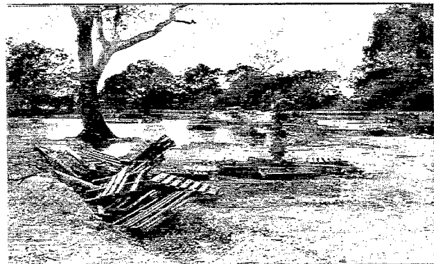
Katnook 2 drillsite shortly after rig release, with christmas tree installed, and prior to flowline connection. The drillsite was in a swamp and has been elevated to avoid difficulties in access over the winter months. The site has since been cleared of rubbish and fully rehabilitated. Photo 42323.

Although a number of documents are required, the approval process is not onerous. MESA is able to assist licensees by providing examples of the documentation and advising on their scope. To date there have been no problems with the regulatory system which has been in place since 1985.